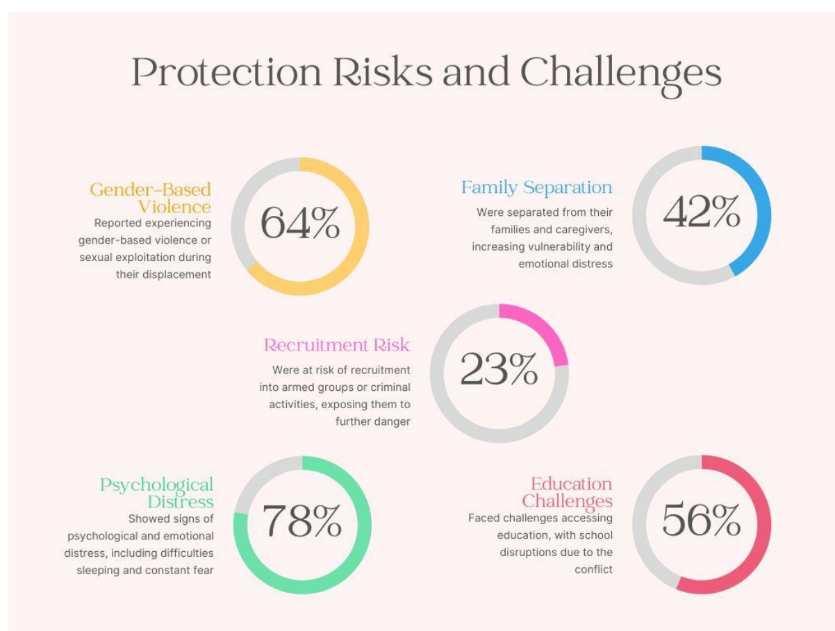
Figure 1: Showing Protection Risks and Challenges of Displaced Ukrainian Children